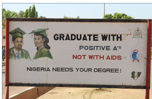
Campus of Ahmadou Bello University in Zaria, Nigeria

At its inception during the colonial rule and even in the post-independence era, in the 1960s, the university in Africa was part of a nation-building project. It was designed mostly for the needs of a public service that was organised around the state institutions. Grounded mostly in secular norms, as its name suggested, it had to be modern, democratic, open and universal, while informing critical minds. Based on this vision, it was supposed to train generations of Africans who were then to ensure the independence, development and