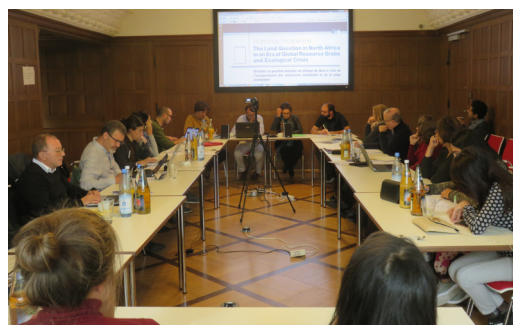
Intensive discussions during the sessions and beyond