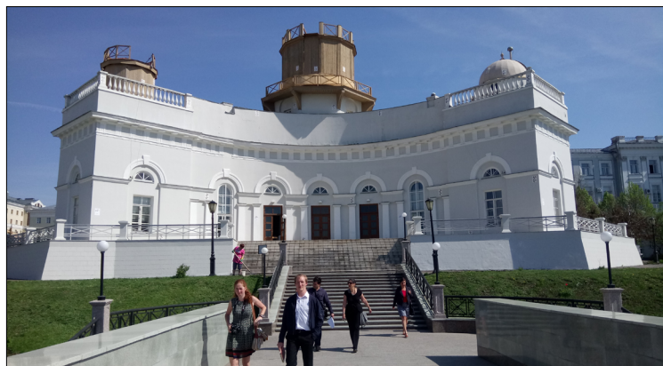
Astronomical Observatory of Kazan Federal University (completed in 1837)