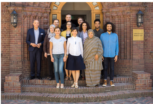
In front of ZMO's entrance door