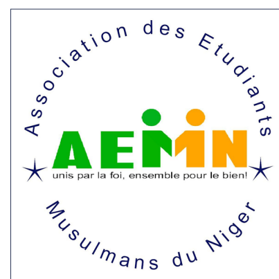
Logo of an Islamic organisation on the campus of Niamey, Niger

The project covers Niger and Nigeria, which will provide a basis for comparison in the study of a dynamic that clearly transcends academic traditions. In fact, many of the issues raised here are not exclusive to the two cases the project focuses on. On the contrary, they seem to be