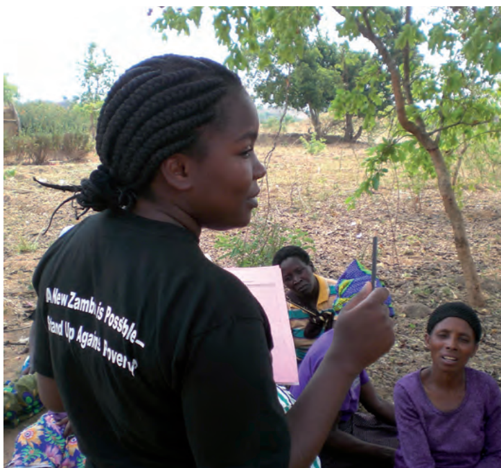
Sensitization and human rights education in rural Zambia.

Zambia's second UPR was hoped to provide a stimulating input into the constitution reform process initiated in late 2011 as this would offer an excellent opportunity for strengthening the respect, protection and fulfillment of political and civil rights and the incorporation of economic, social and cultural rights into the country's supreme legislation. However, despite strong engagement by civil society, since late 2013 the Government has been stalling on this reform process.