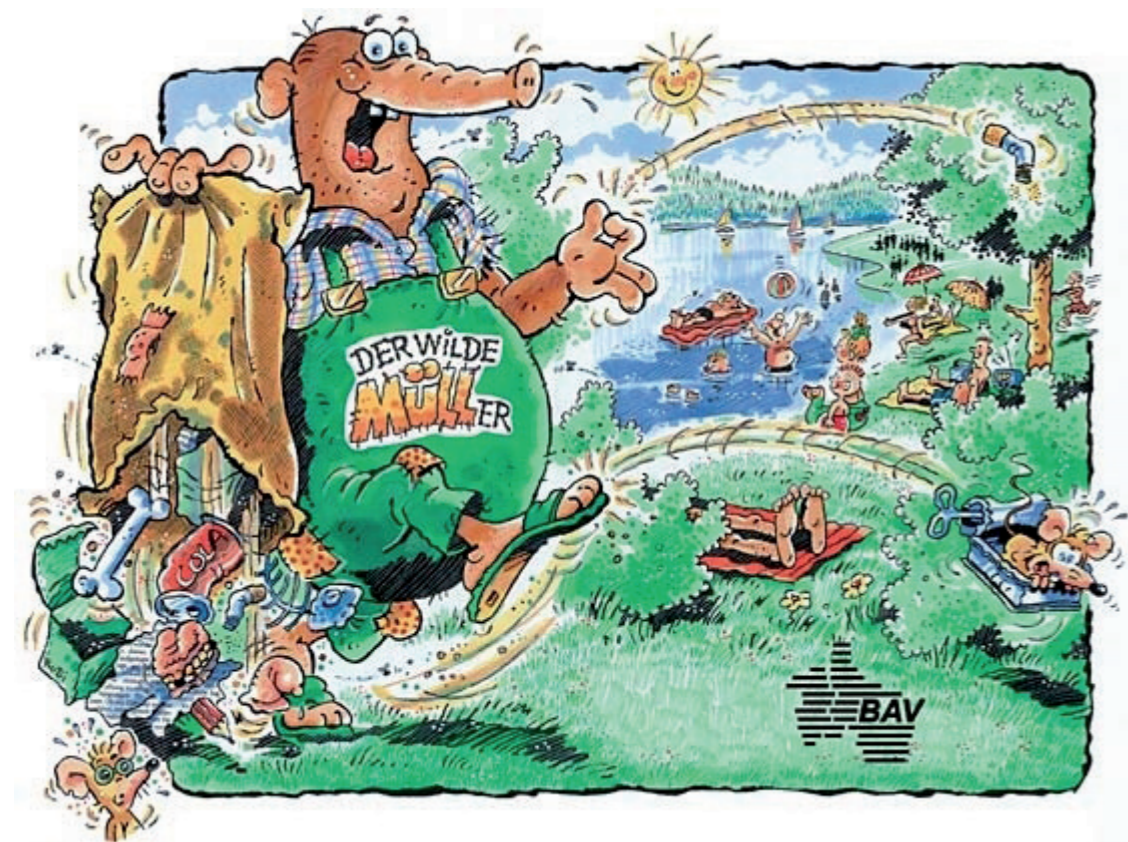
Figure 1.

fore finally turning to questions of method. Firstly, social actors are related to discourse in two ways: on the one hand, as the holders of the speaker position , or statement producers , who speak within a discourse; and on the other hand, as addressees of the statement practice . The sociological vocabulary of institutions, organizations, roles, and strategies of the individual or the collective – but always of social actors – can be used for a corresponding analysis of the structuration of speaker positions in discourses. But, actors generally appear on the discursive level, too: Subject positions/Identity offerings depict positioning processes and “patterns of subjectivization,” which are generated in discourses and which refer to (fields of) addressees. Consider the following cartoon: