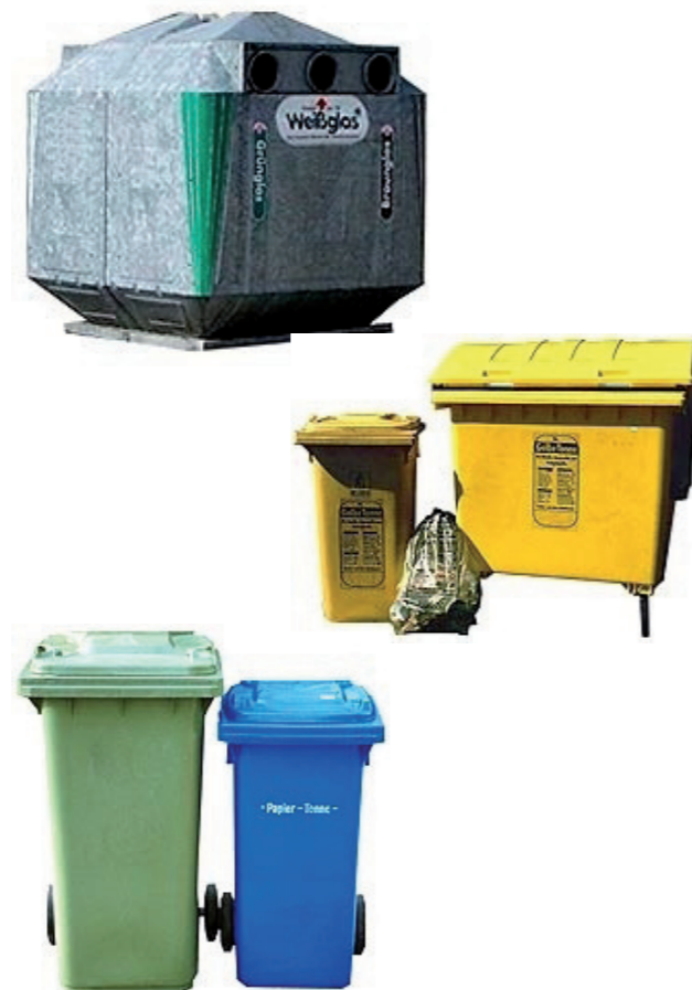
Figure 5. Some elements of waste disposal systems.

We have so far discussed some core conceptual elements of SKAD. We shall now focus on the “knowledge side of discourse,” that is of the symbolic orderings proposed and performed in singular discursive events and series of such events. Discourse includes both: form and content. Discourse research may concentrate on the sociohistorical genealogy, variation and transformation of such forms, following questions like: In what way does a speech or a text have to be formally constructed to count as being part of political, religious, scientific discourse at a given historical moment and context? Second,